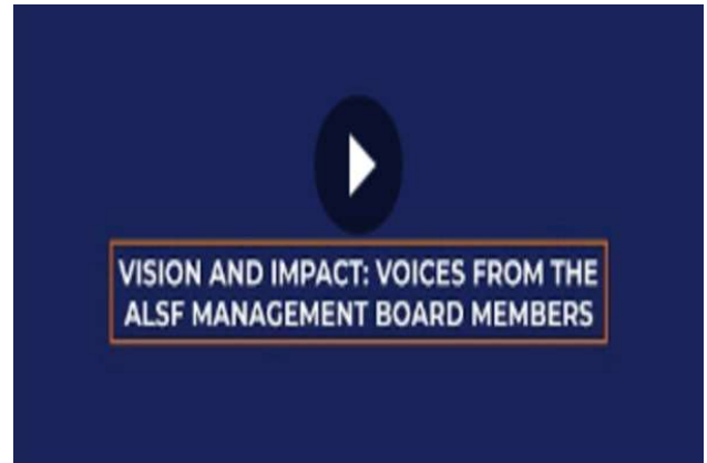
Vision and Impact: Voices from the ALSF Management Board members