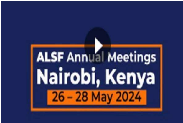
ALSF Annual Meetings Nairobi, Kenya 26 - 28 May 2024