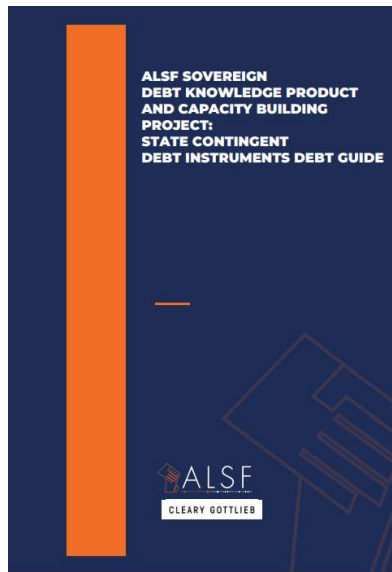
ALSF sovereign debt knowledge product and capacity building project: State contingent debt instruments debt guide