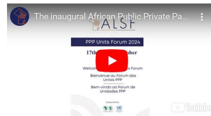
The inaugural African Public Private Partnerships - Units Forum on 17-18 September 2024 in Nairobi